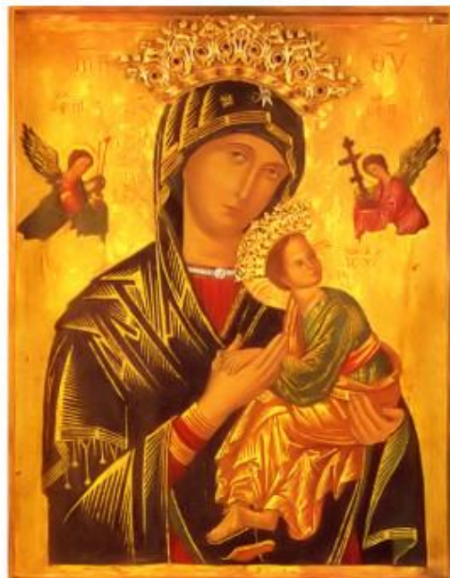
Mother of Perpetual Help Pray for Us